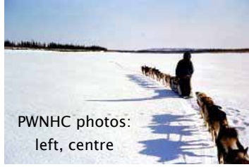
PWNHC photos: left, centre