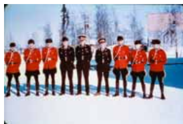
PWNHC photos: top, right, bottom