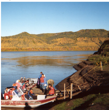
Boat landing courtesy of GSCI