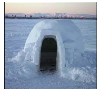
Igloo in Aklavik