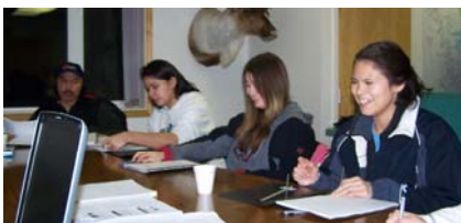
Home Visit staff from Tsiigehtchic

Most participants are asking about the structure of the Gwich'in Government...this seems to be the most confusing.