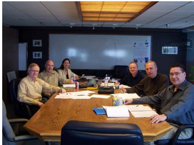
Gwich'in Self Government Negotiation Session April 24-26, 2006 in Inuvik