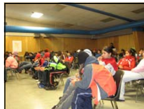
Fort McPherson Students