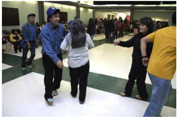
Steppin' Out at the Inuvik Community Christmas Feast and Dance