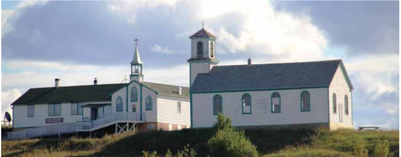
Tsiigehtchic