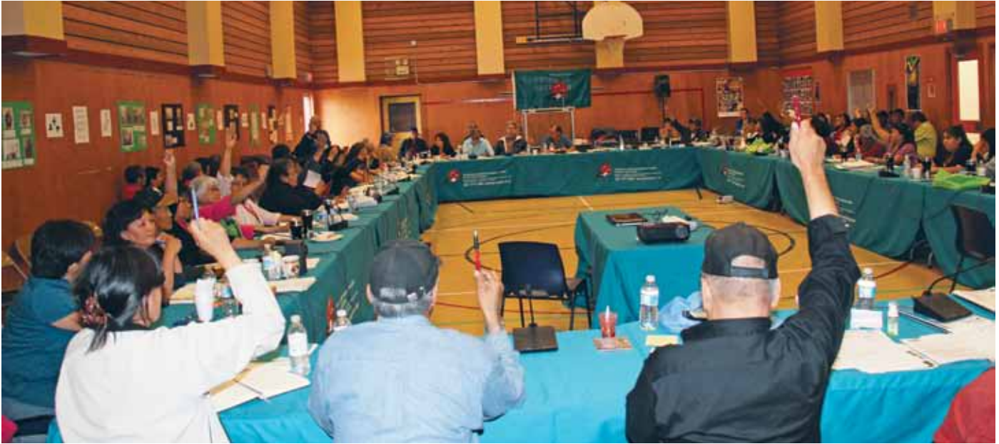
AGA Delegation