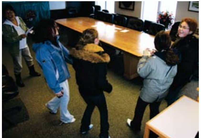
...and then had to do a jig before on their way to the next stop.