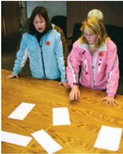
As part of the SHSS scavenger hunt, teams did a blind selection of GTC staff names...